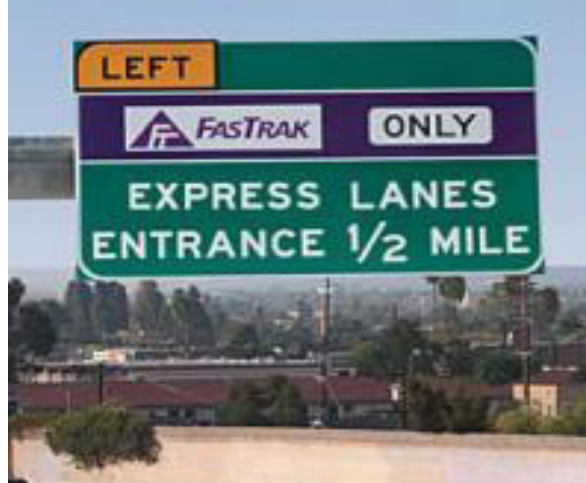
Example of a transportation system management strategy using Intelligent Transportation Systems

Examples of physical changes include turn lanes, signage, roundabouts, striping, and traffic calming measures. Changes to how the roadway is used include incident response, ramp metering, transit signal prioritization, highway access management, and managed lanes (High Occupancy Vehicle (HOV),