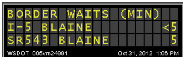
Variable Message Sign used at the U.S./Canada border